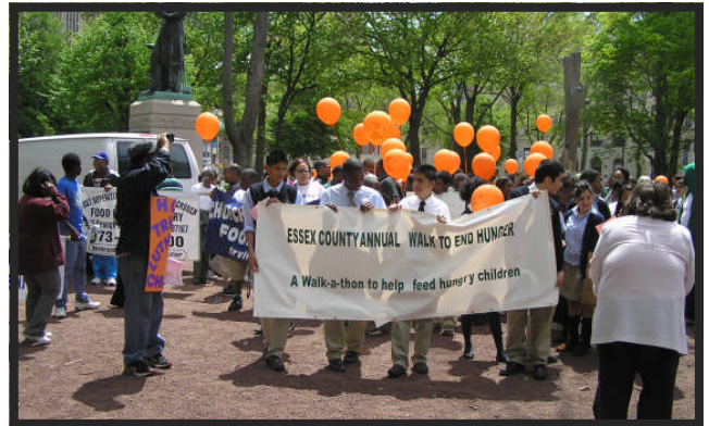
Students from Christ the King Prep, Newark, holding the banner at the Eighth Annual Essex County Walk to End Hunger