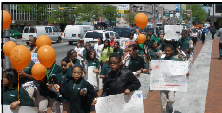
North Star Academy students participating in the Walk

walkers, escorted, escorted by the Newark Police Department, set off for 50 Walnut. The walkers, chanting "Help Us Feed—Kids in Need—1 in 6 Are Hungry" were warmly greeted by pedestrians and shoppers along the route, some of whom joined enthusiastically in the chant or offered other signs of support. The walkers continued down Broad Street in an or-