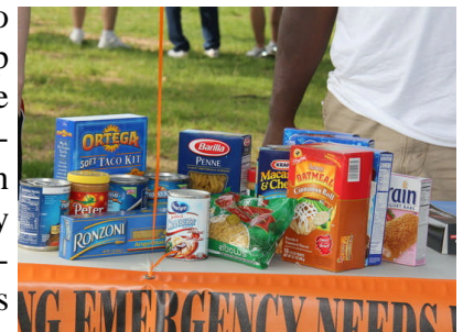
Some typical staples contributed

In addition to providing critical help for those in need, the Cougar Soccer Club believes that taking part in the food drive was a very meaningful and productive experience for its participating members and their coaches and parents. The club felt