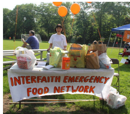
Some food contribution

of the participants supported the food drive with plastic bags of staple food or cash contributions. As a result, the MEND pantries received a much-appreciated 1,100 pounds plus of food and over $200 from contributions from Saturday tournament participants.