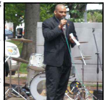
The Honorable Eldridge Hawkins Mayor of Orange